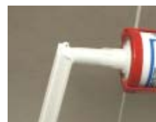
Clean Profile - Fit the long length 1st - Add generous silicone with large nozzle - Fit profile and remove excess with Fugi 2 or finger - Now fit end pieces