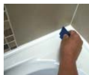
Change to fine nozzle - Seal in top and bottom of profile with silicon - Fit End Caps - Use Fugi 2 to remove excess silicone - Leave to Set ( 4 Hours )

Note. Byretech recommends that all black mould in the bathroom is removed prior to fitting its products.