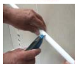
Measure length of bath and transfer measurement to 2m profile - Mark and cut to length by scoring and snapping profile - lay on bath "dry"